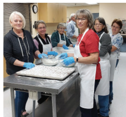
Our annual lutefisk dinner was served October 21st. Sverdrup Lodge members and Mandan Eagles volunteers take a break to pose while preparing the lutefisk and making the meatballs.