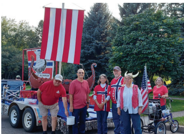
Sverdrup Lodge entered their float in the annual Autumnfest Parade in September.