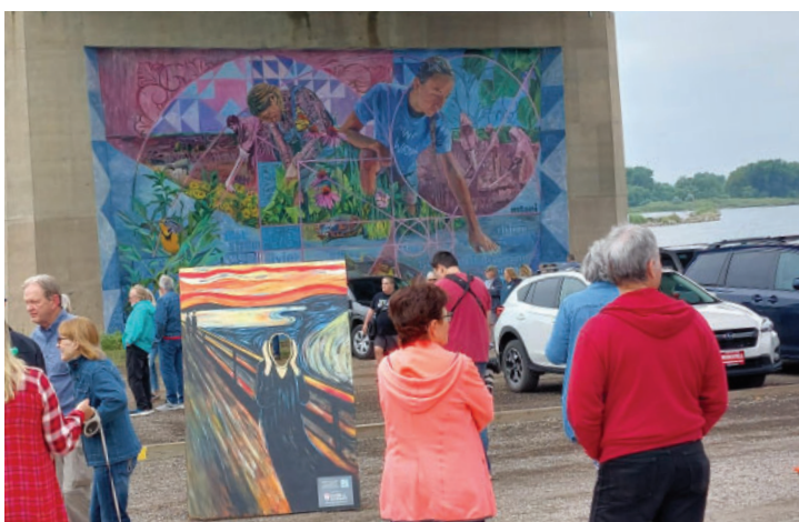
The unveiling of the community mural, support by a Community Grant through the Sons of Norway Foundation, was held on August 21st. Edvard Munch's The Scream was a fun photo op that was a partnership between Bismarck Art Gallery Assoc. and Sverdrup Lodge.