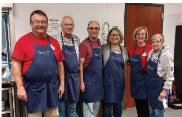
Sverdrup Lodge sponsored and served the community meal at the Banquet on September 9th.