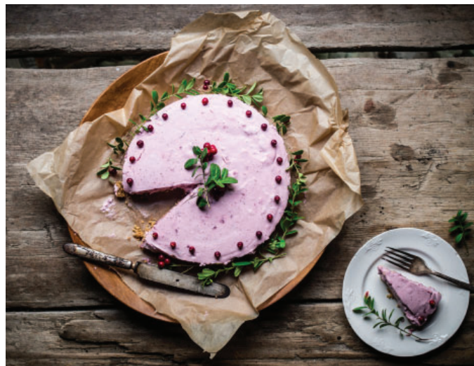
Whipped Lingonberry Cheesecake (Tyttebærfromasjkake)